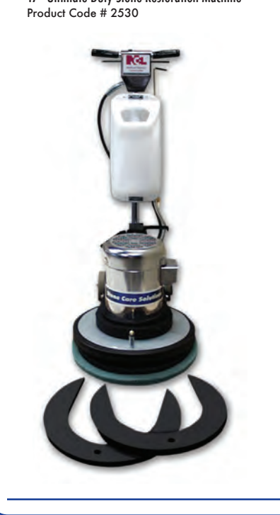
STONE BLAZER™ 17" Ultimate Duty Stone Restoration Machine

NAT-SPEED™ 17" High Productivity Diamond Driver Product Code # 2551 Packaging: Individual